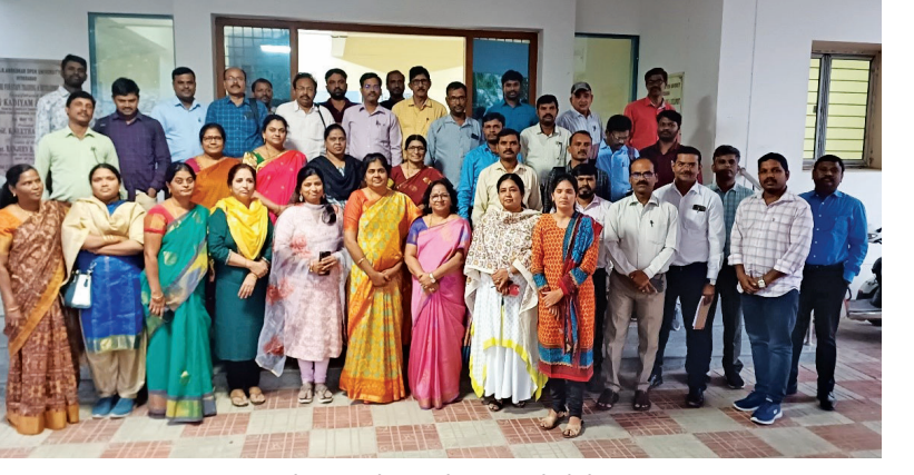
BRAOU Faculty Members who Attended the Training

The draft institutional OER policy was reviewed by CEMCA and sent to the University authorities for formal approval after which it would be implemented by the University.