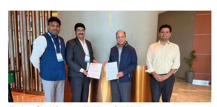
Signing of MoU between CEMCA and APSCHE

CEMCA, in association with Andhra Pradesh State Council of Higher Education (APSCHE),