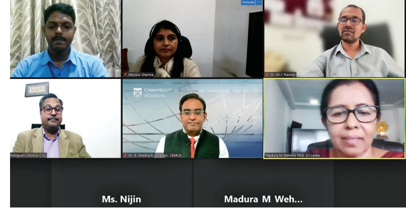
Inaugural Session of Training on Virtual Labs in Sri Lanka

Virtual Labs are an effective alternative in situations when science and engineering teachers and students cannot access physical labs due to resource and/or mobility constraints. To train Higher Education teachers from Sri Lanka in using these labs, CEMCA