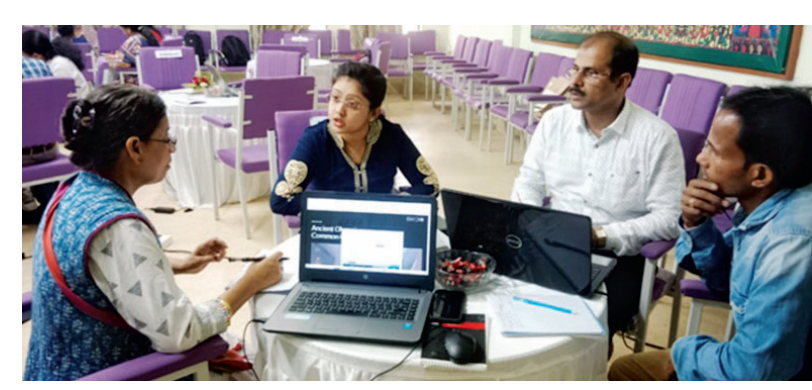
OER Workshop in Progress at Vidyasagar University